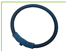
Rigid Passive Tag

The system can be installed across your fleet and all your fueling locations, with a wide variety of RFID tags available to fit vehicles and trucks of every size and shape. Most existing fuel nozzles can be fitted with RFID readers, including most popular nozzle models.