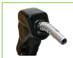
RF Nozzle Reader